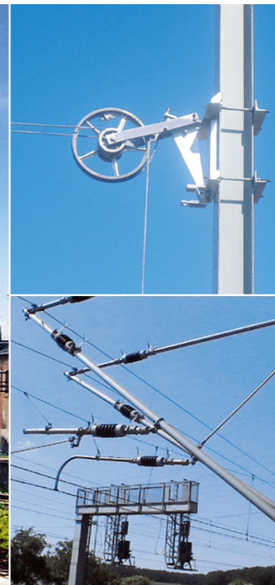
◀ RIBE® tension wheel with integrated cable brake - For smooth braking