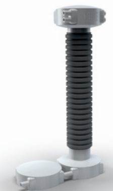
OPPC termination units RIBE® termination units come in different versions and cover a voltage range up to 420 kV, making them suitable for nearly all cable types.