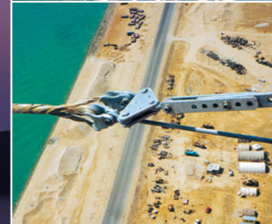
◀ Suez Canal 700 m span length (205 kN RTS).