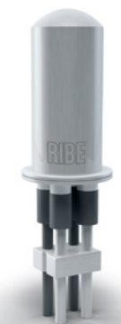
Universal Metal Hood Joint Type 180 Our metal hood joint for all diameters:

The universal metal hood joint 180 offers great flexibility for connecting OPGW cables since it covers all diameters from 9 mm to 28.6 mm with a single product. The hood joint installation set includes all of the parts and adapters needed to install all types of OPGW cables. This ensures fast, effective and cost-efficient on-site installation. Together with the optimized housing and connectors with variable inlet diameters, fewer single parts are needed for installation making the joint a flexible all-rounder.