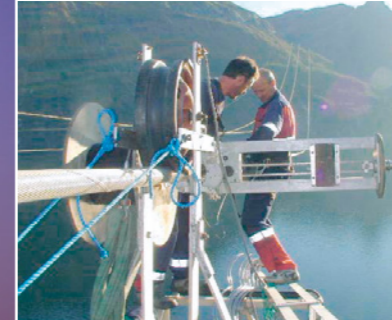
◀ Fjord crossing in Norway Sunnalsfjord: 3 spans, max. 3,670 m span length (436 kN RTS).