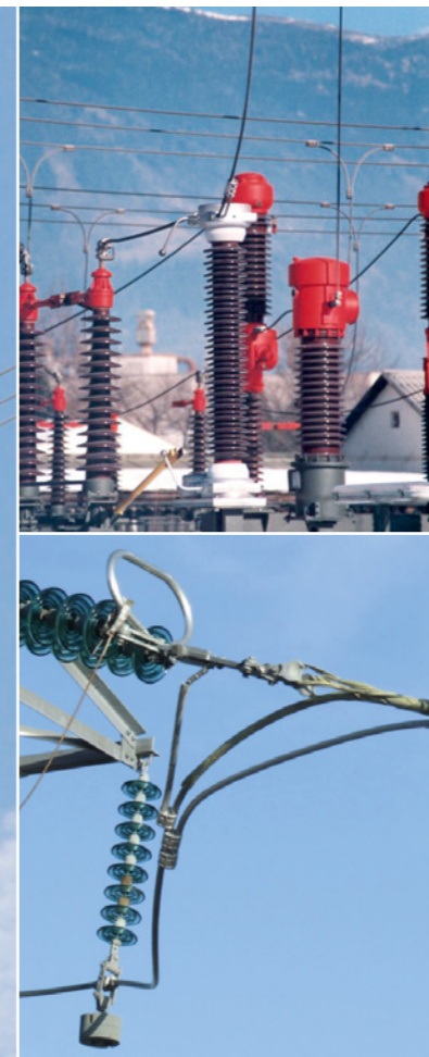
◀ OPPC Standing termination unit