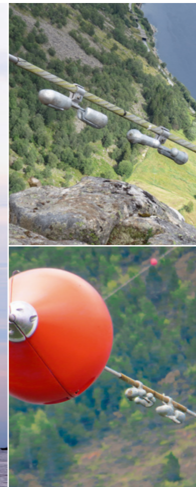
◀ Vibration dampers installed on protection rods.