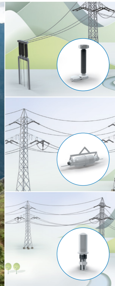
◀ RIBE® OPPC Termination Unit Brings fiber optics to ground.